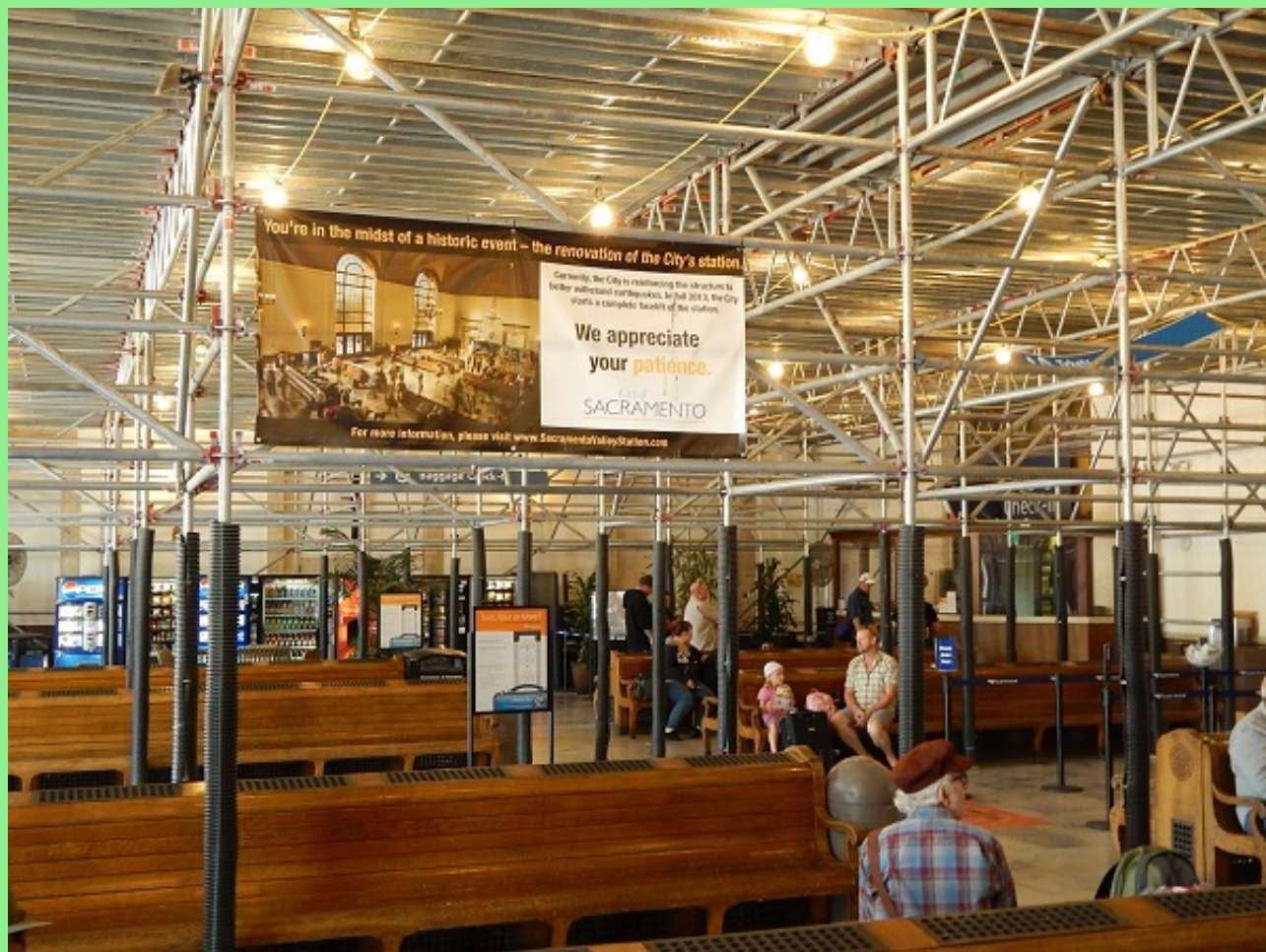
This is the main hall of the Sacramento Station now as the ceiling and upper walls are being restored.