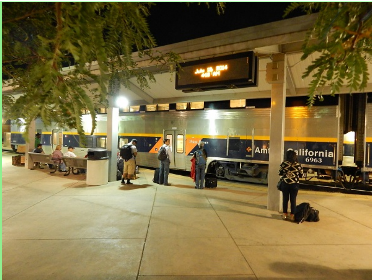
Early morning in Bakersfield with passenger waiting for the first northbound of the morning to load.